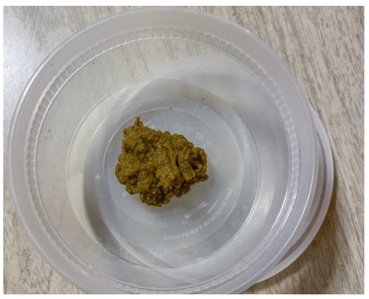
The curry sauce. It's packed with flavor.