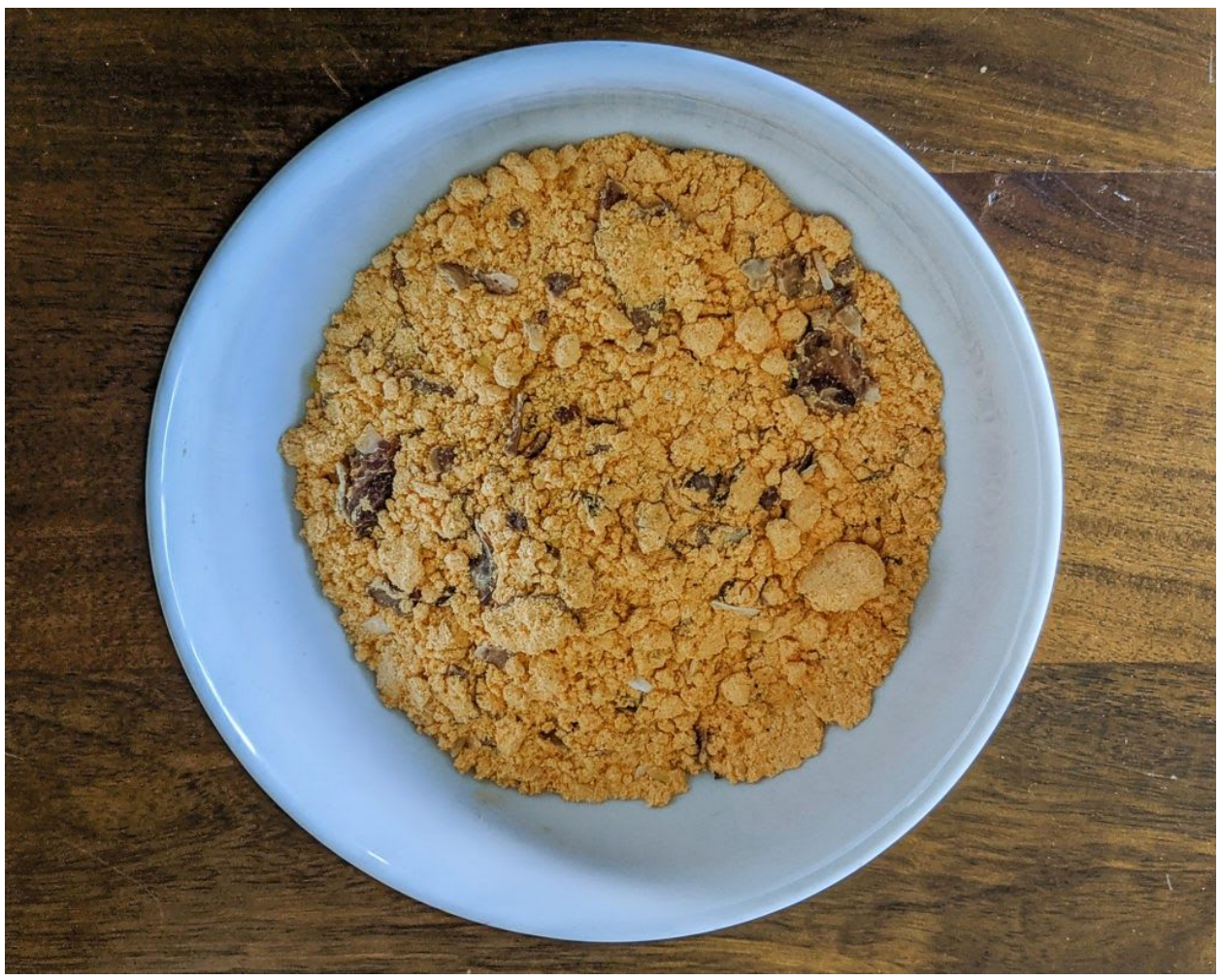
Pack the dried ingredients together in a snack bag.