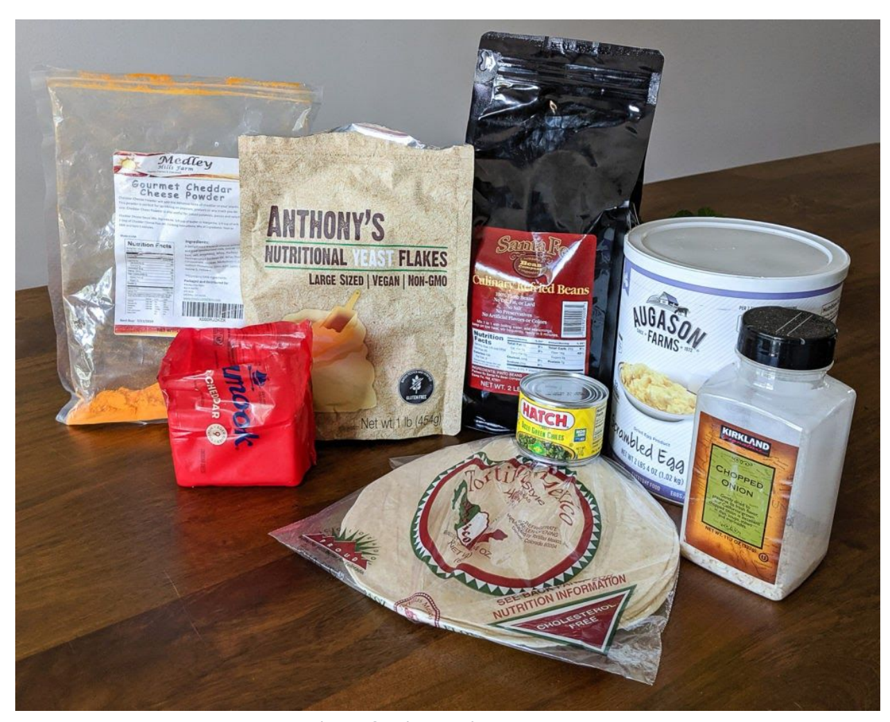
Ingredients for the Southwest Egg Burrito