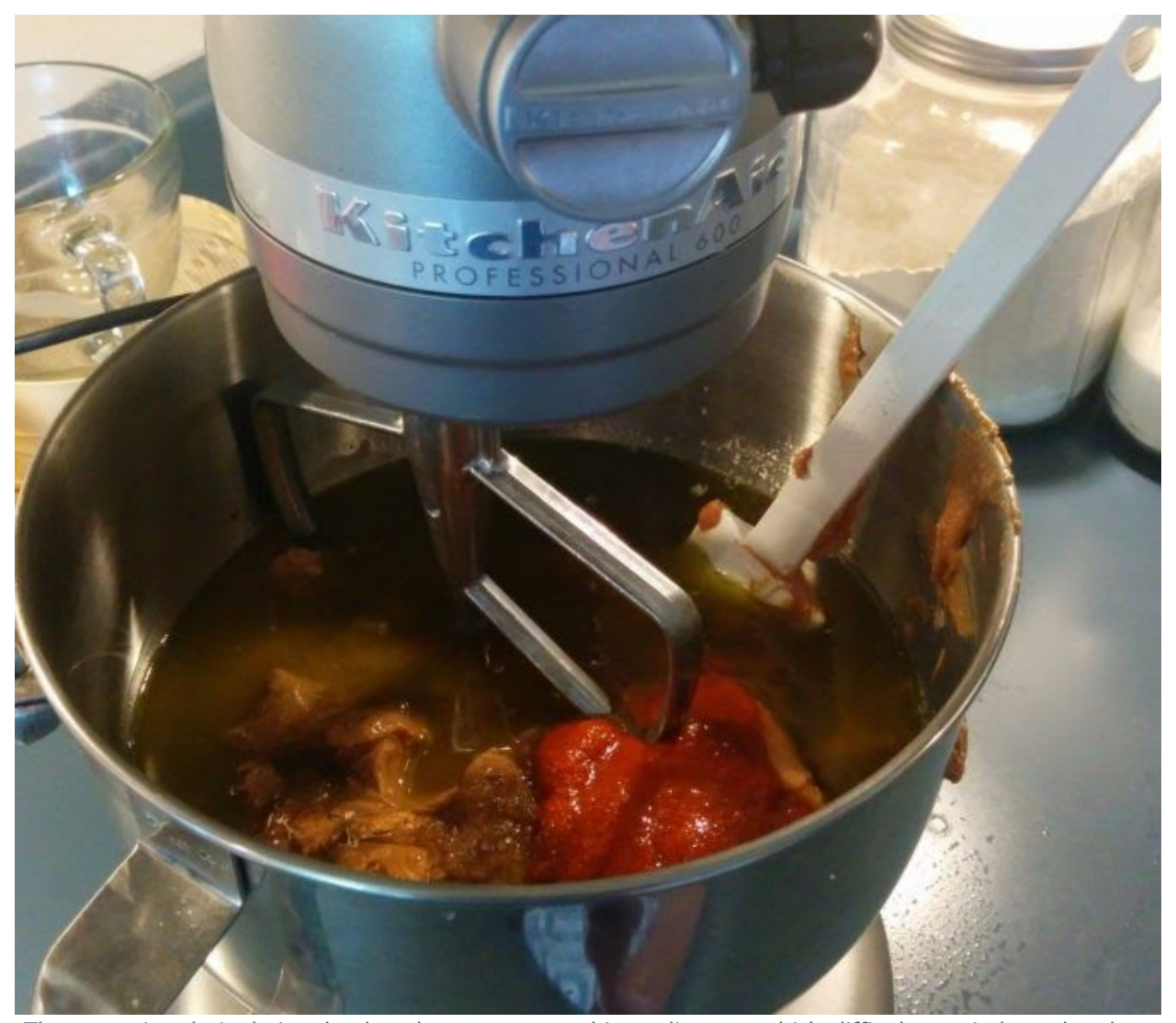
The sauce is relatively involved — there are several ingredients, and it's difficult to mix large batches without a mechanical mixer. So I make big batches that I can send out on group trips or that I can pull from for short solo trips.

Carry the sauce into the field in a 4- or 8-oz Nalgene HDPE Container or a 16- or 32-oz Nalgene Wide-Mouth Bottle. Even if you only need one serving, do not attempt to use a 2-oz bottle to save a few grams over the 4-oz or 8-oz size — you will struggle to pour the sauce into it and to clean it later.