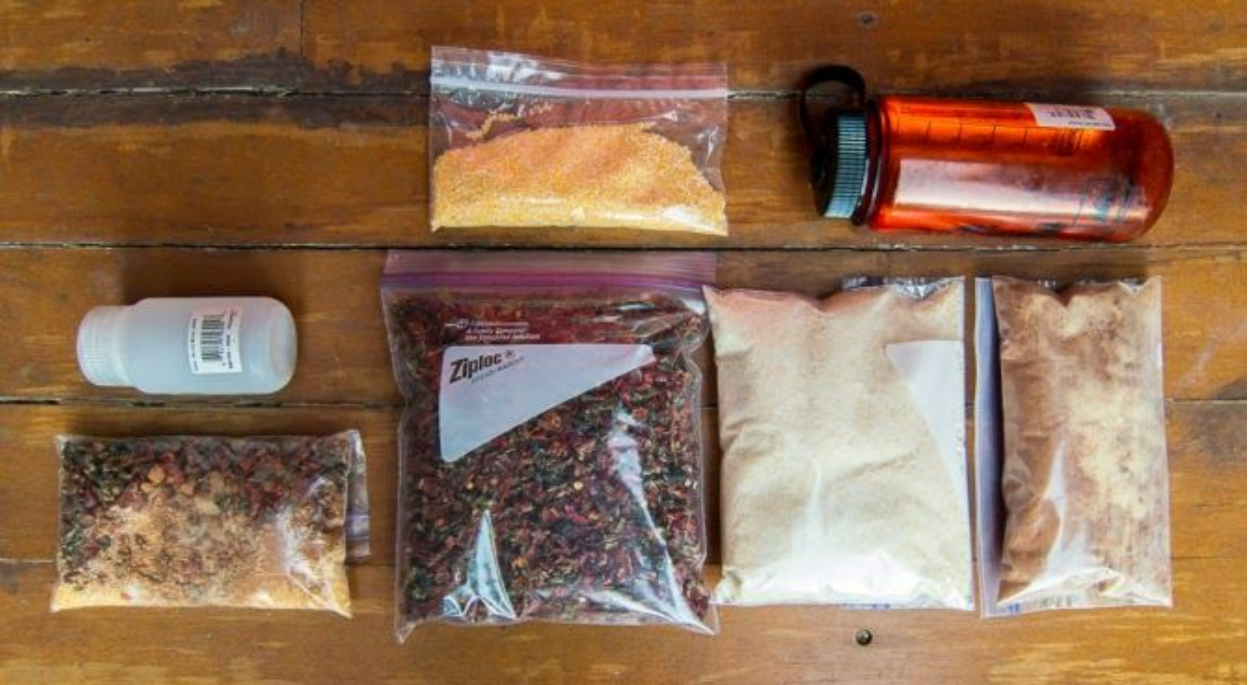
Individual serving, left: one bag of ingredients + bottle of olive oil. Group serving, all other bags and